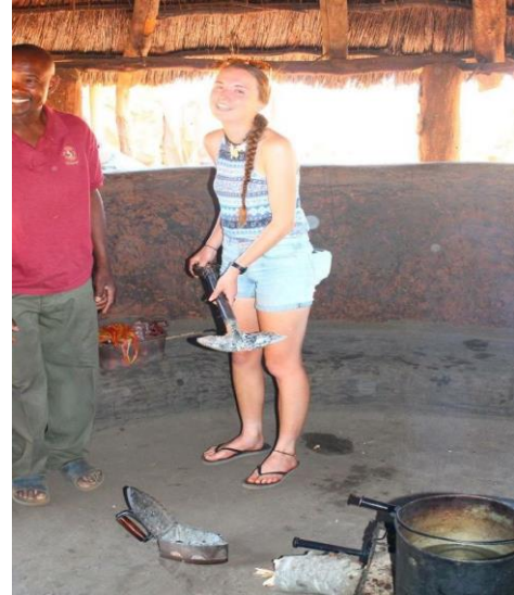
Hands on work in the community

Details of our programmes and projects are available on our website: www.londolozatrust.com