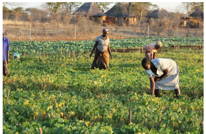
Local women work on a vegetable garden