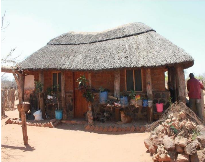
A local house in the community